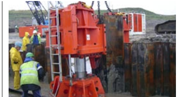
Specialist Work >